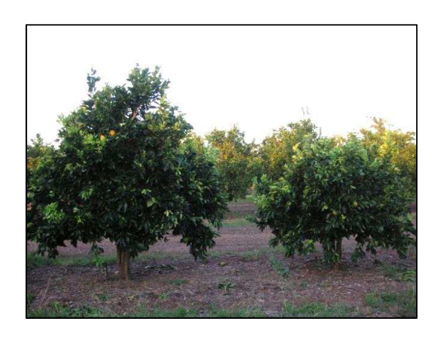
Healthy sweet orange tree (L) and a tree infected with orange stem pitting (R)

Do not move citrus propagation material from Queensland to other states to avoid spreading ORANGE STEM PITTING