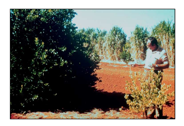
Tree protected by a mild CTV isolate (L) and an unprotected tree infected with severe CTV (R)