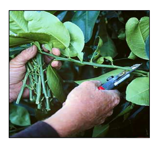
Use healthy budwood from Auscitrus

There are no cures for virus infections. To reduce the impact of severe CTV isolates, manage aphid vector populations and use high health status budwood from Auscitrus. Grapefruit budwood supplied by Auscitrus has been sourced from trees inoculated with a mild protective isolate of CTV to protect trees against infection from severe grapefruit stem pitting isolates. In Australia, there is no commercially available mild isolate of CTV to protect oranges against severe stem pitting.