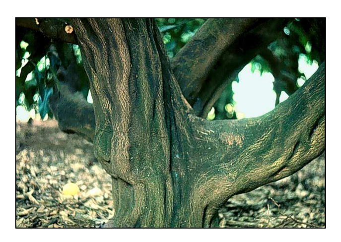
Stem pitting symptoms on a grapefruit tree

In Australia, CTV can cause stem pitting in lime, grapefruit or sweet orange cultivars and some rootstocks, but with a high degree of specificity. For example, isolates that induce severe stem pitting symptoms in oranges do not cause symptoms in mandarins. Trees affected by stem pitting have poor growth, brittle branches, and reduced yield and fruit size. Pits range in size from large grooves to small indentations; growth is more severely affected by smaller pits. Orange stem pitting isolates of CTV have only been reported in Queensland.